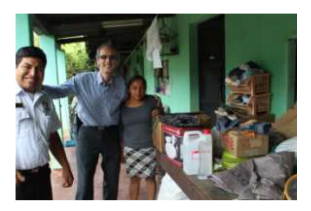
Handing out kitchenware to a family